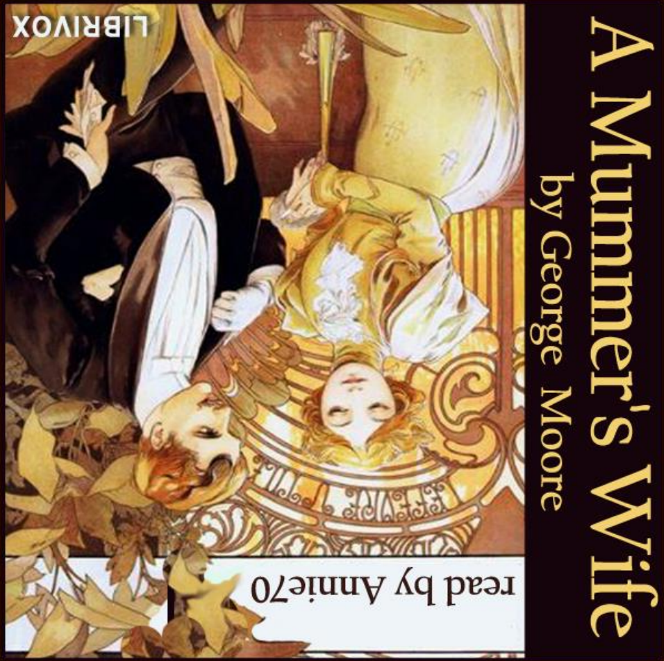
Cover image: from "The Flirt", Lefevre Utile bisquit tin art by Alphonse Mucha 1899 Cover design for Librivox by Michele Fry

Print Page 3 on regular or 20 lb bond paper for ease of folding.